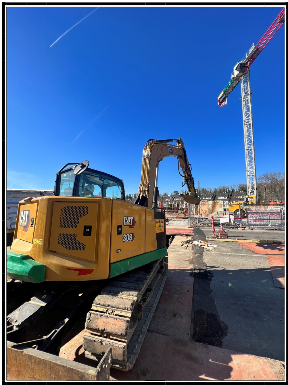
LIHI MLK SCL Work